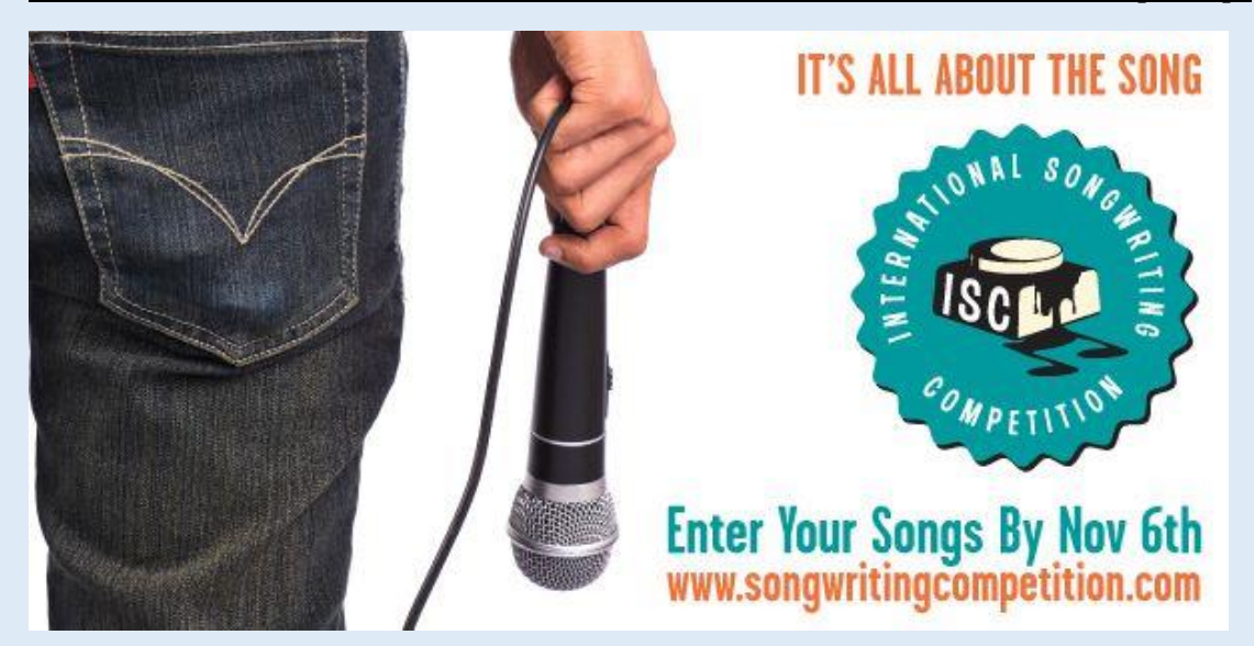
"THE SONGWRITING COMPETITION TO TAKE NOTE OF..." —NEW YORK TIMES

"The International Songwriting Competition (ISC) is an annual song contest whose mission is to provide the opportunity for both aspiring and established songwriters to have their songs heard in a professional, international arena. ISC is designed to nurture the musical talent of songwriters on all levels and promote excellence in the art of songwriting. Amateur and professional songwriters and musicians are invited to participate.