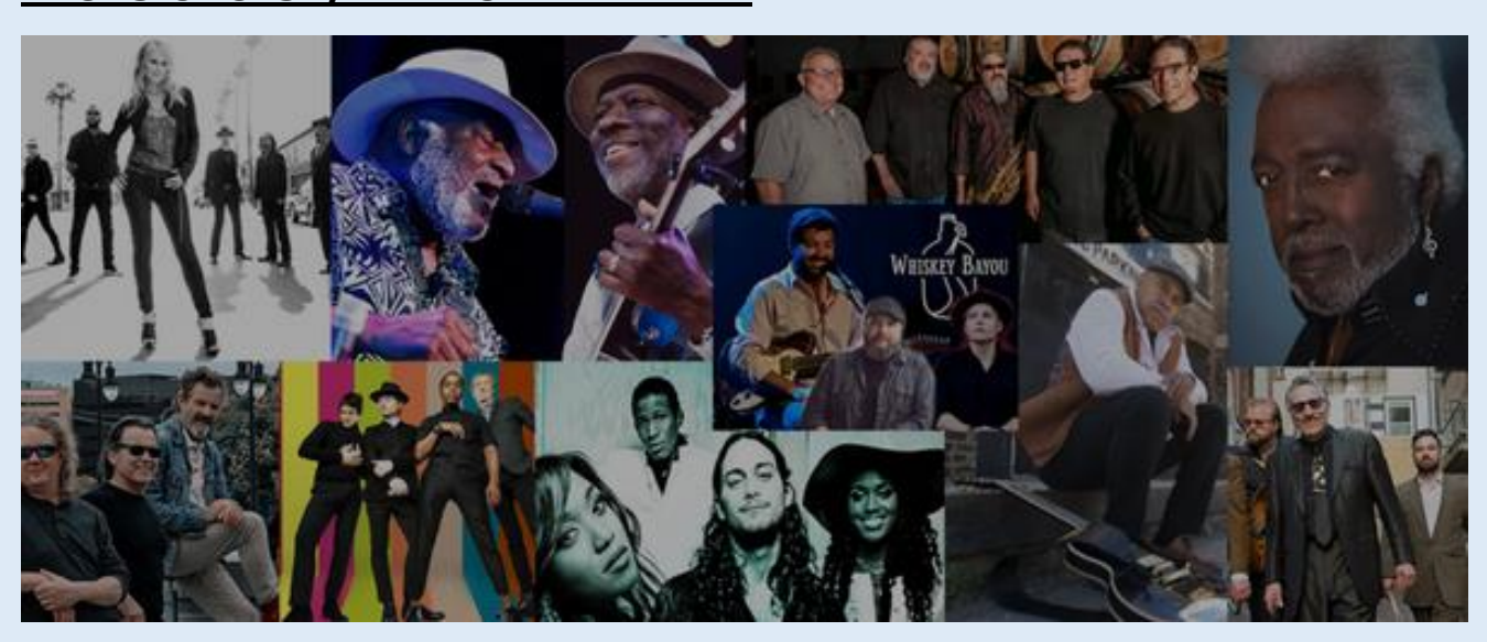
Oct 26 - Nov 2, 2019/8 days

The granddaddy of cruises, <u>Blues Cruise</u> was founded in 2002, and sells out both of its twice annual sailings well in advance. In fact, its upcoming sailings are already wait-listing people. Why is this such a hot ticket? In part due to the jam sessions and artist workshops that make it much more interactive than the typical concert setting. A lot of blues fans are also amateur musicians — and the opportunity for them to pick up an instrument and jam alongside their idols makes this the highlight of a lifetime.