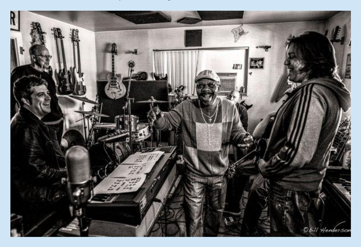
Photo above was taken at Greaseland Studios in San Jose, CA