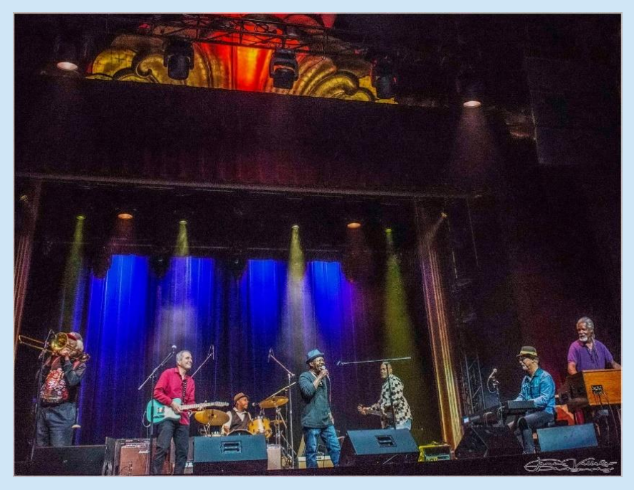
Photo of Wee Willie Walker's last performance with Anthony Paule at The Empress Theater in Vallejo, CA